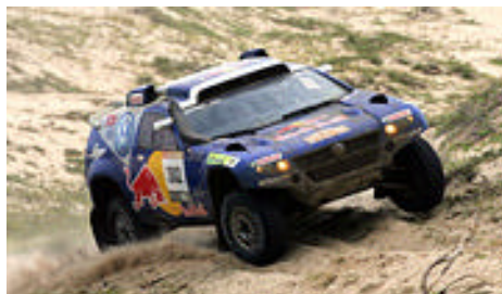
Race Touareg 2 in action - powered by a 280 hp 2.5-litre TDI turbo-diesel engine.

The driving teams also completed an intensive fitness course which included running, mountain biking, and rock climbing.